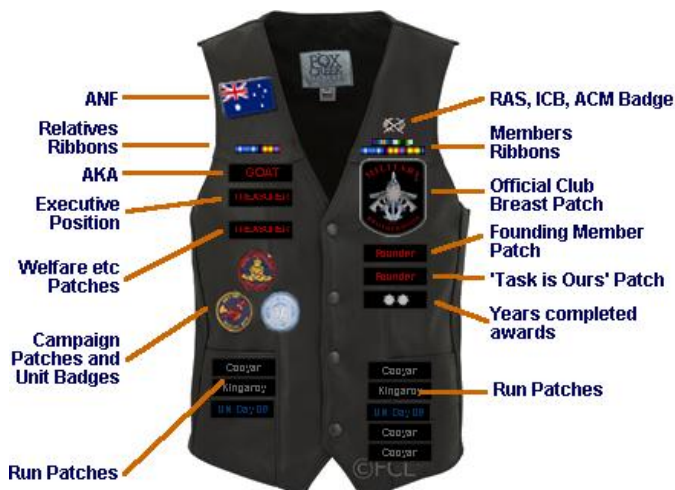
Figure 1 – Position of Awards and other Responsibility Patches