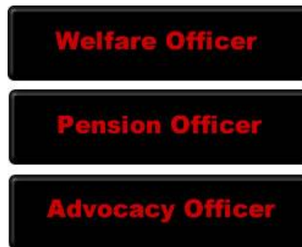
Figure 3 – Extra Responsibilities Patches

4. Additionally, each member within the Club who completes any of the suite of courses offered under the DVA TIPS program is eligible to wear the 'extra responsibilities' patch (ref Fig 3). Refer to Fig 1 and SOP 3 – CSODs for correct placement of patches.