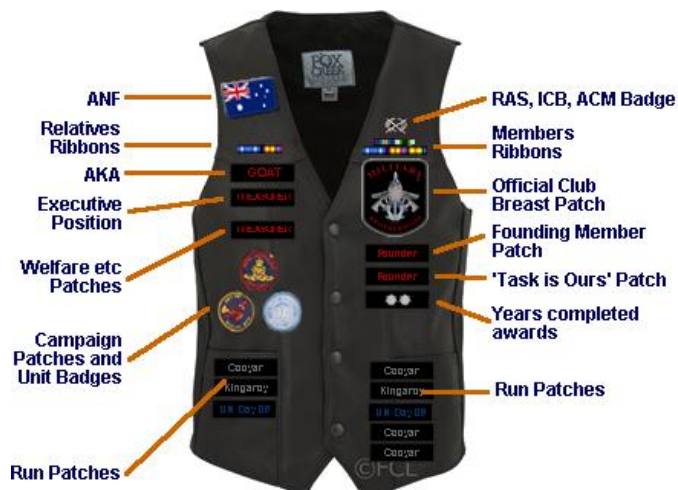
Figure 1 – Position of Awards and other Responsibility Patches