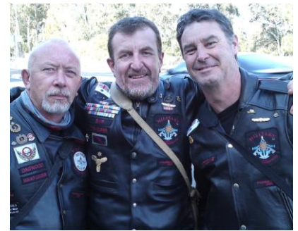
Gold Coast Members