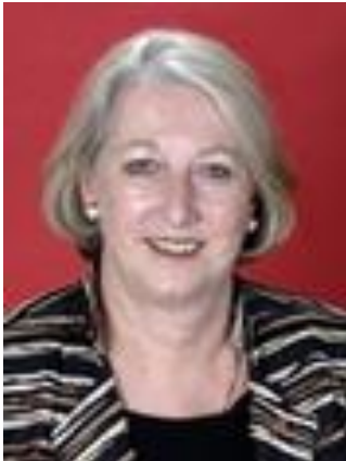
Senator Sue Boyce

Along with this first edition of our quarterly newsletter, Nostrum Est , is the official opening by Senator for Queensland, Senator Sue Boyce of the Veterans Assistance Centre, VAC SLIPPER , which occurred on the 11 th of June 2011.