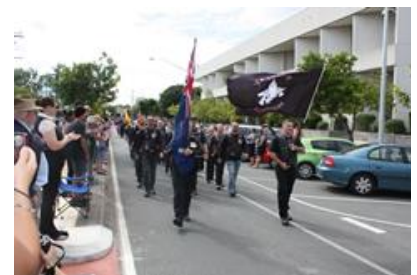
Gold Coast Sub Branch on Anzac Day in Beenleigh, Qld

TIP OF THE DAY - Pop rivet your ID disc to your vest, just above the flag. It has your Club number on it.